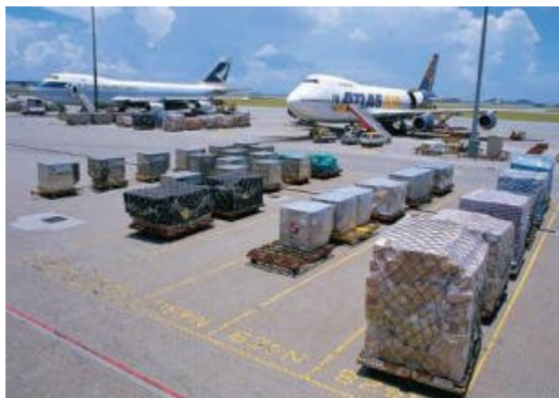
Cargo loading yard at HKIA