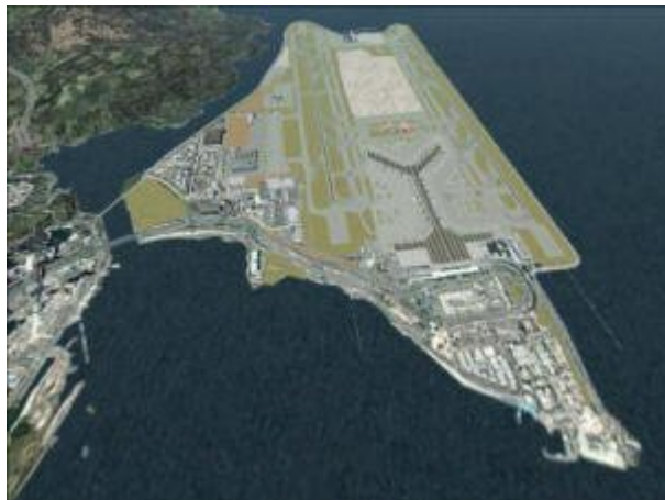
An Arial view of Hong Kong International Airport

HKIA is a gateway to China, the world's fastest growing trade and investment center. HKIA offers state-of-the-art facilities to handle the steady growth in Air cargo traffic into china.