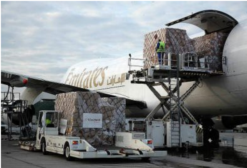
Airport by Schenker

An Emirates Sky Cargo aircraft now departs Dubai International Airport every Saturday at 23:30 h local time, heading for Germany with 110 tones of cargo on board. Six hours later, the cargo for European destinations is received by Schenker employees at Hahn, and the aircraft is loaded with additional shipments for the US market. The cargo aircraft will land in Toledo eight hours later. There the largest and highest-capacity hub of the combined Schenker and BAX organizations for the US market feeds the shipments into the American distribution network. On the return flight, the aircraft arrives in Hahn again in the early morning and in Dubai in the afternoon.